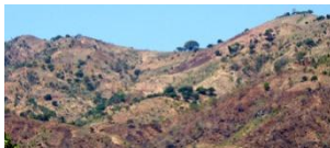
One of the heavily deforested and eroded hills at Chikwawa, Malawi